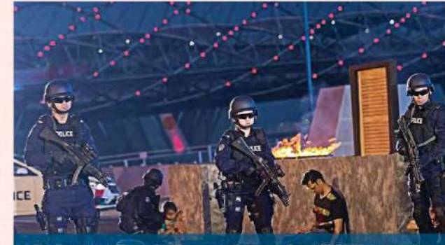
The Formidable Team: Our Emergency Response Team (ERT) officers guarding the hostages after their successful neutralisation of the terrorists. The ERT was commissioned on 6 June 2016, complementing the Ground Response Force in responding to terrorist attacks. They form an additional level of tactical force to SPF's initial response to terrorist attacks.