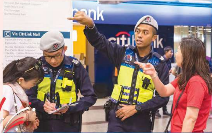
Excuse Me Sir: Officers from the Public Transport Security Command attending to a member of the public's query. They are part of a huge team of officers deployed for crowd management and security coverage at the nearby train stations.

In a sea of red and white at Singapore's biggest birthday bash, one particular group stood out – our men in blue. Catch our officers in action as they demonstrate the Singapore Police Force (SPF) counter-terrorism capabilities during the show segments and see how they work tirelessly to ensure the safety and security of the 25,000 spectators who were present at the 52nd National Day Parade (NDP) held at The Float @ Marina Bay.