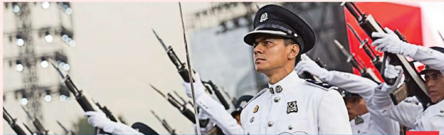
Fire Away: The SPF's Guard of Honour contingent firing their guns during the Feu-de-joie or Fire of Joy to celebrate our nation's birthday. They are part of the 31 marching contingents representing the five pillars of Total Defence during the NDP 2017 parade and ceremony segment.