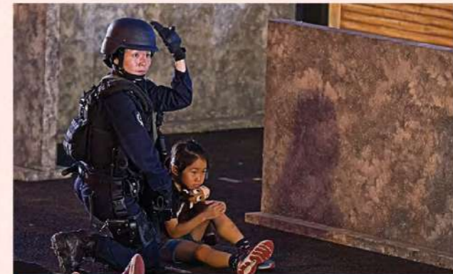
You Are In Safe Hands: A young girl rescued by our ERT officers after successfully neutralising the terrorists during the D3 segment.