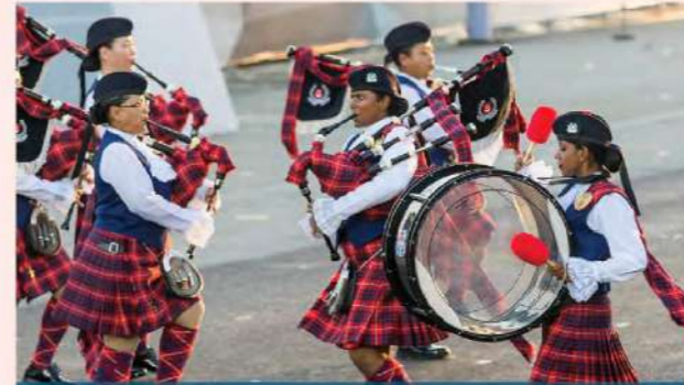
A Moving Performance: Bagpipers from the SPF Women Police Pipes and Drums (WPPD) performing during the largest NDP military tattoo performance to date. This is the WPPD's first ever participation in an NDP military tattoo performance.