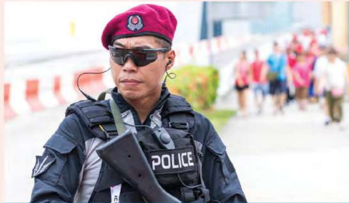
Keeping an Eye: Our Special Operations Command officers patrolling and keeping a lookout for suspicious persons. Security measures were beefed up around the surrounding areas as the NDP celebrations is gazetted as a 'special event' under the Public Order Act.