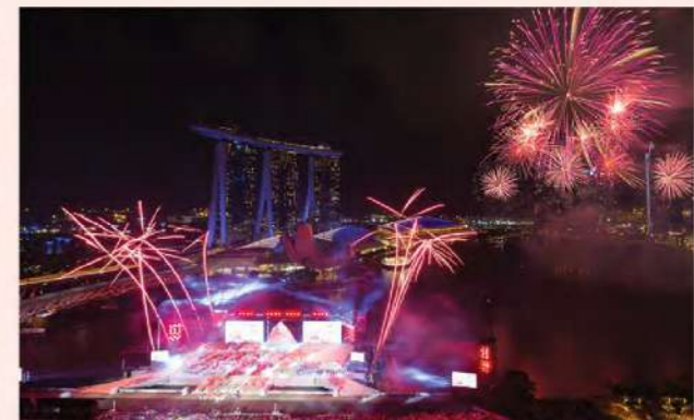
Celebratory Lights: The fireworks display, the most anticipated segment of the celebrations, marks the end of the 52nd NDP celebrations.