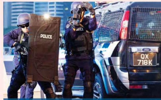
You Are No Threat to Me: ERT officers ready to neutralise the terrorists during the simulated terror attacks. It is ERT's first appearance in this year's NDP D3 counter-terrorism segment.