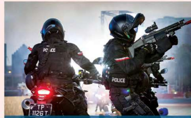
Men in Black: Officers from the Rapid Deployment Troops showcasing their counter-terrorism capabilities during the D3 – Dynamic Defence Display, a simulated terrorist attack segment.