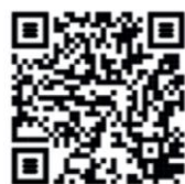
For Android Users