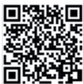
For Apple Users