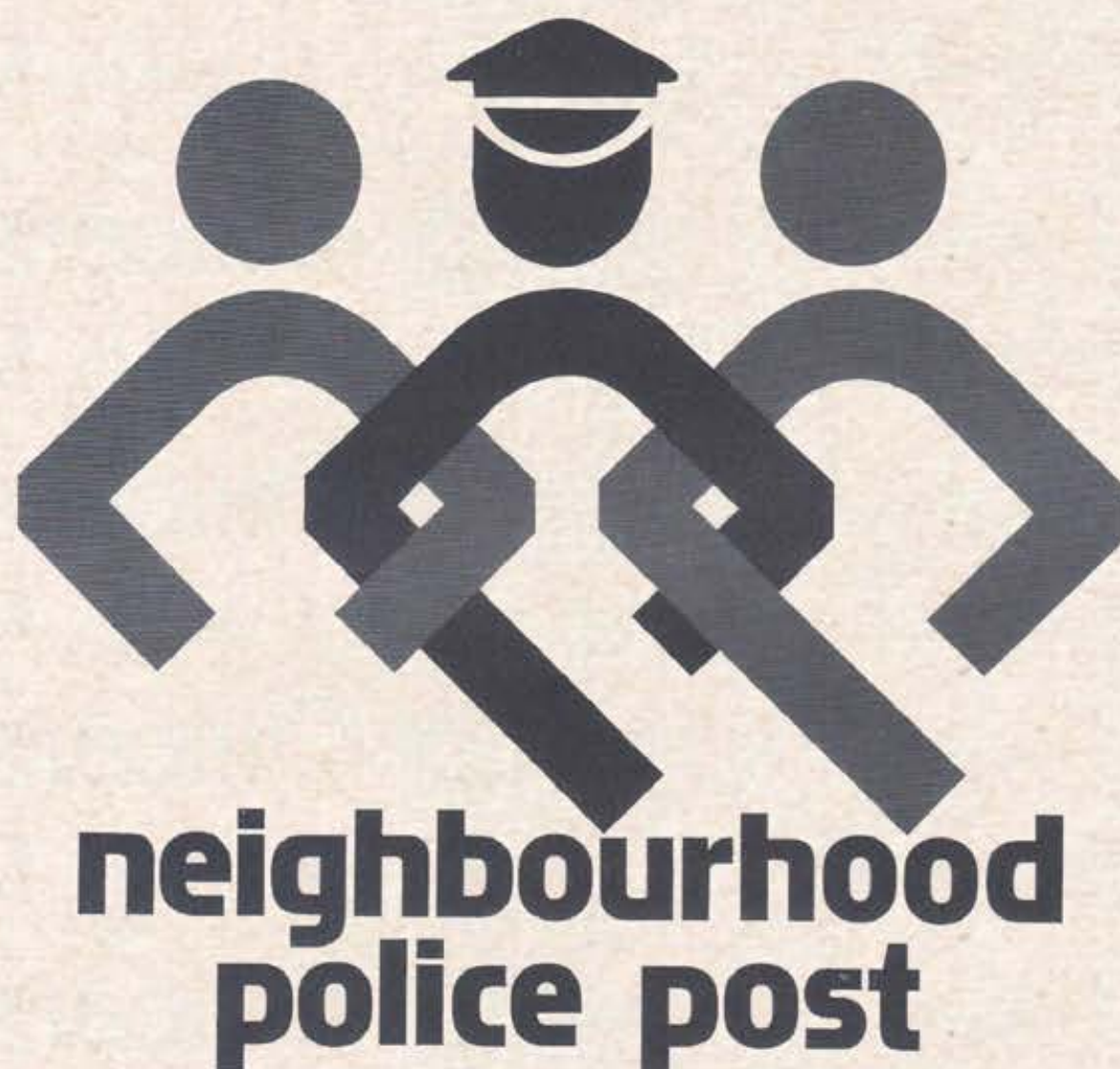
The NPP Logo

The Republic of Singapore Police invited members of the public including professional graphic designers to participate in the Neighbourhood Police Post Logo Design Competition in April 1984. This competition was aimed at obtaining an appropriate logo design for Neighbourhood Police Posts (NPPs) which have been operational in Toa Payoh Division since 1983.